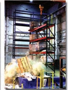
Fixed-Base Storage Rack (without Isolators)